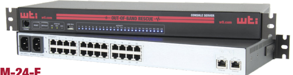
DSM-24-E 24 RJ45 RS232 Ports, Dual Power, Dual Ethernet