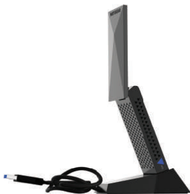
Magnetic cradle included

Push button connection to your WiFi router with WPS 1